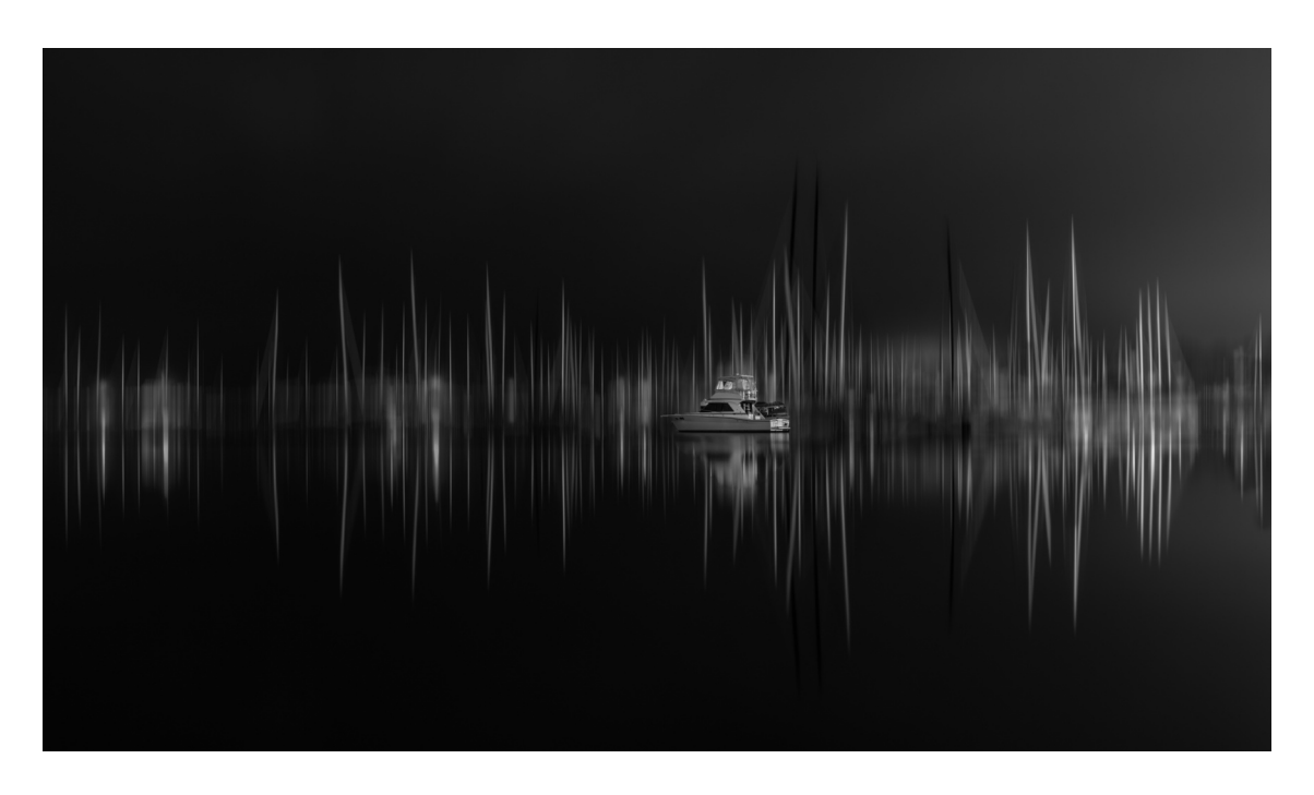
The Waterfront