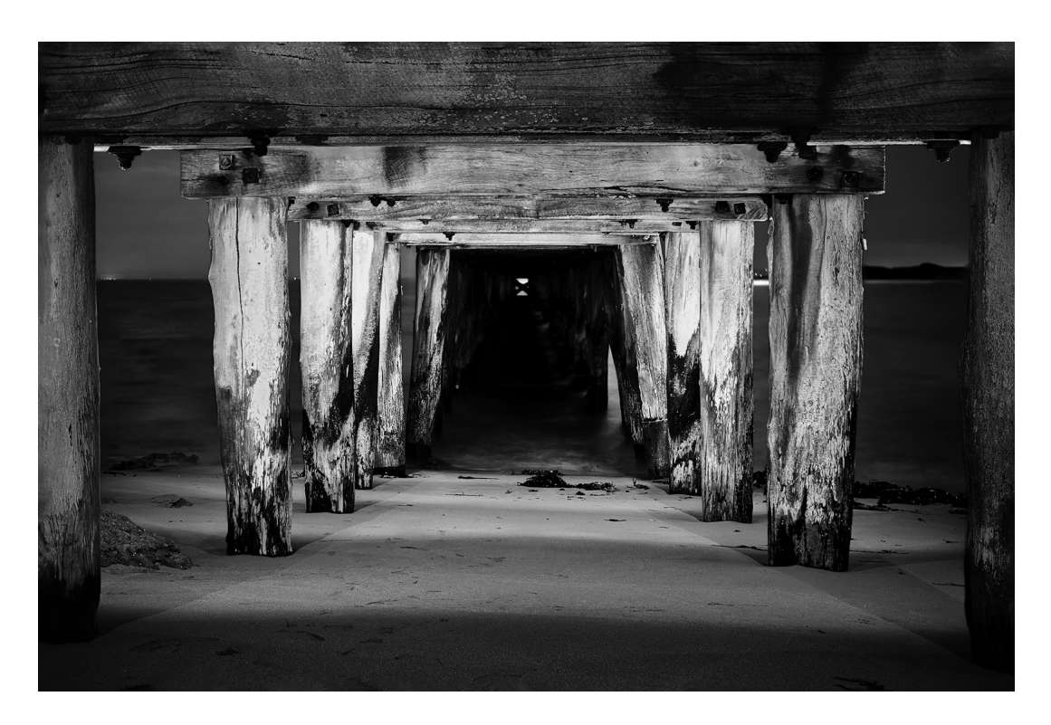
Here for the Pier