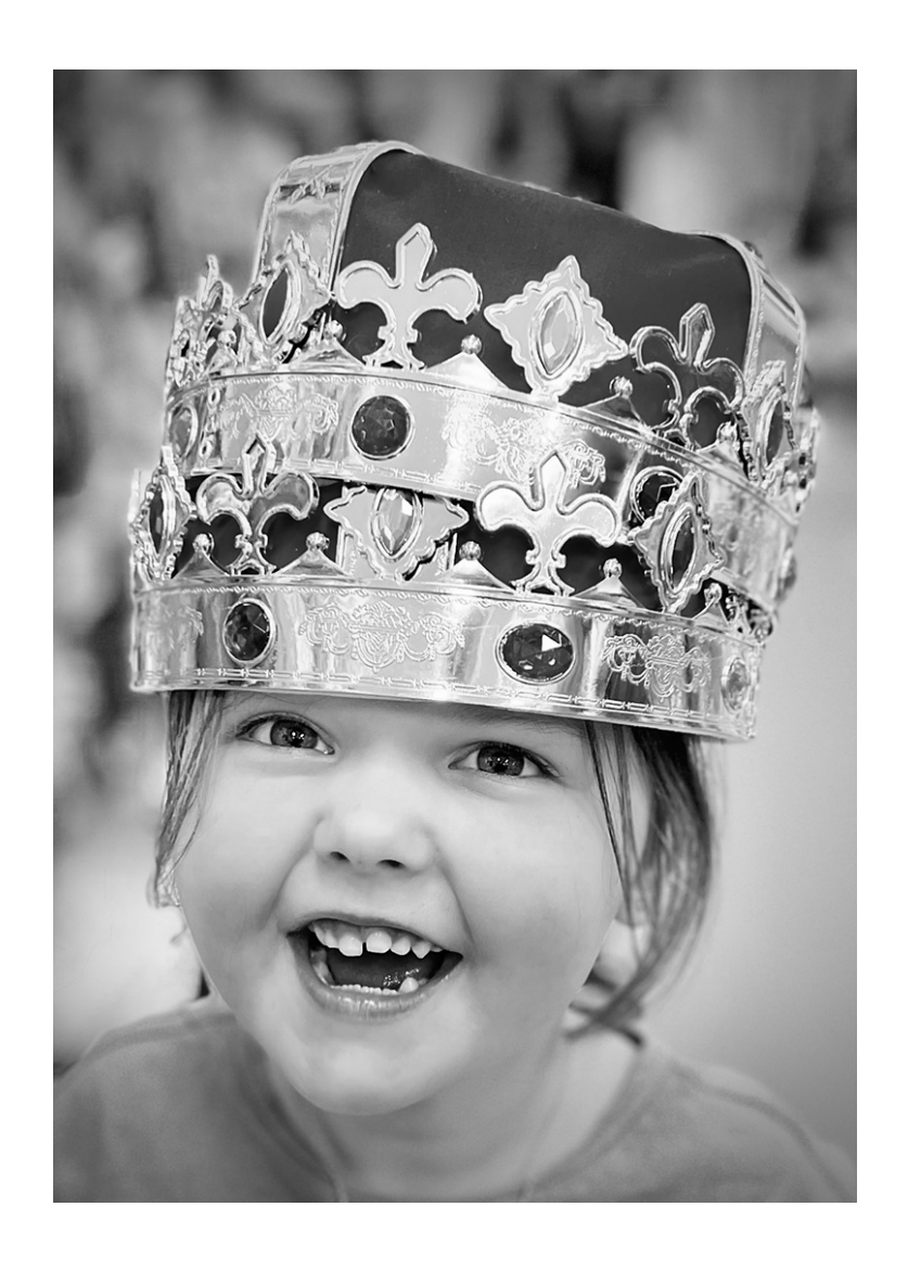
Playing Around