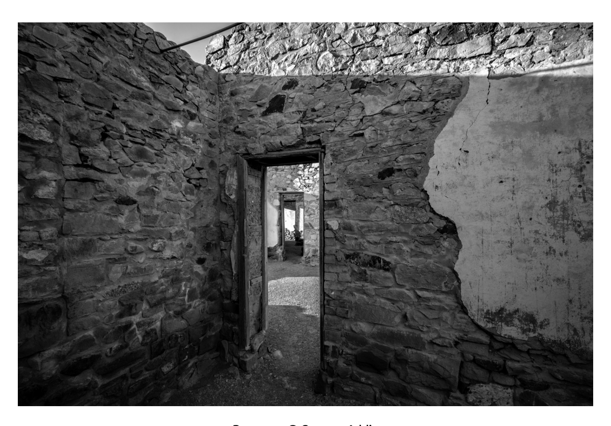
Passages © Graeme Addie