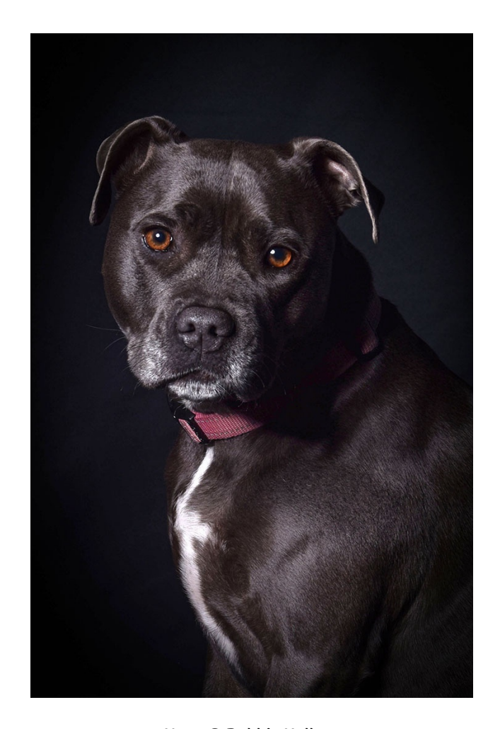
Nova © Debbie Hallows