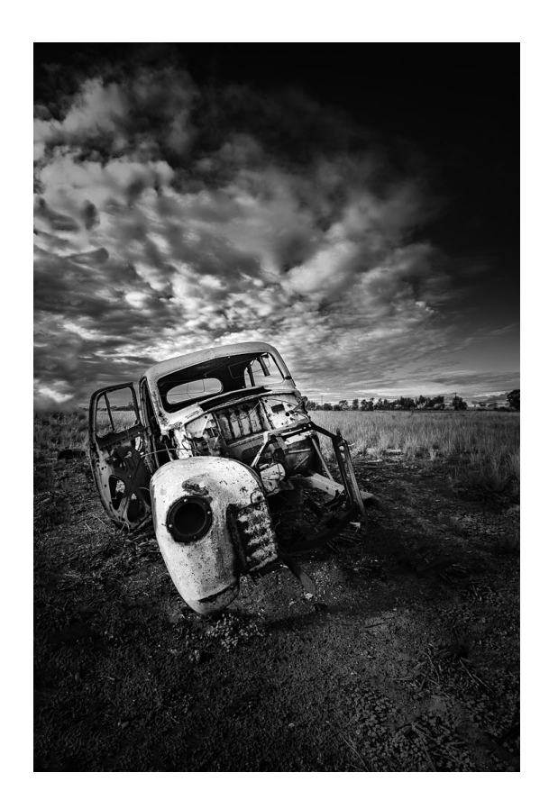
Me A Fast Car © Ray Farrugia