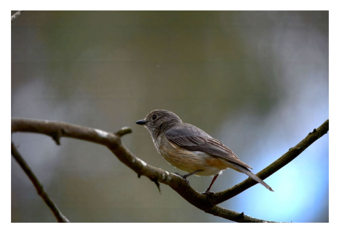
Female Rufus Whistler