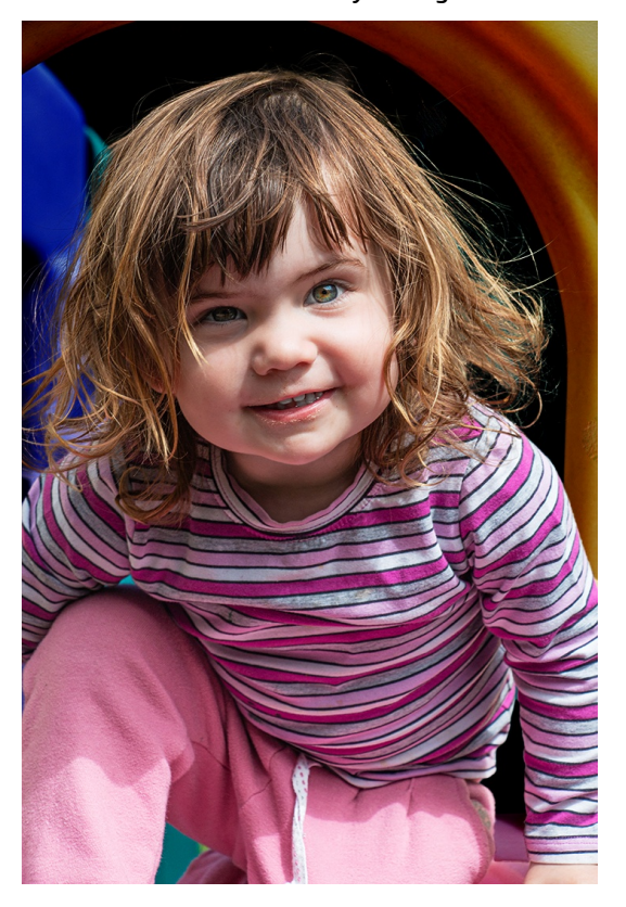
Nixi © Liz Furey