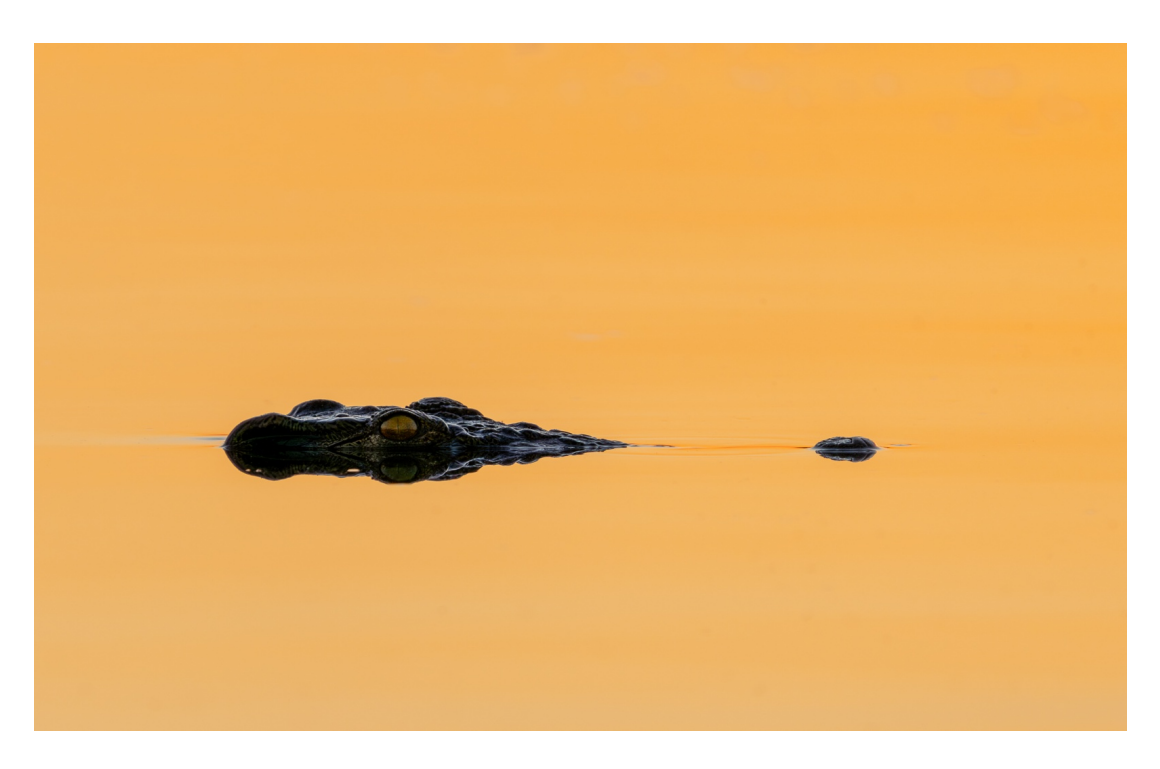
The Predator