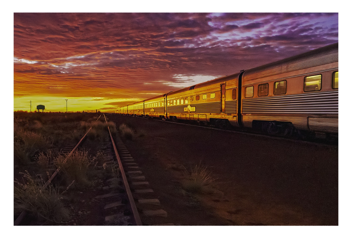
Ghan Sunrise