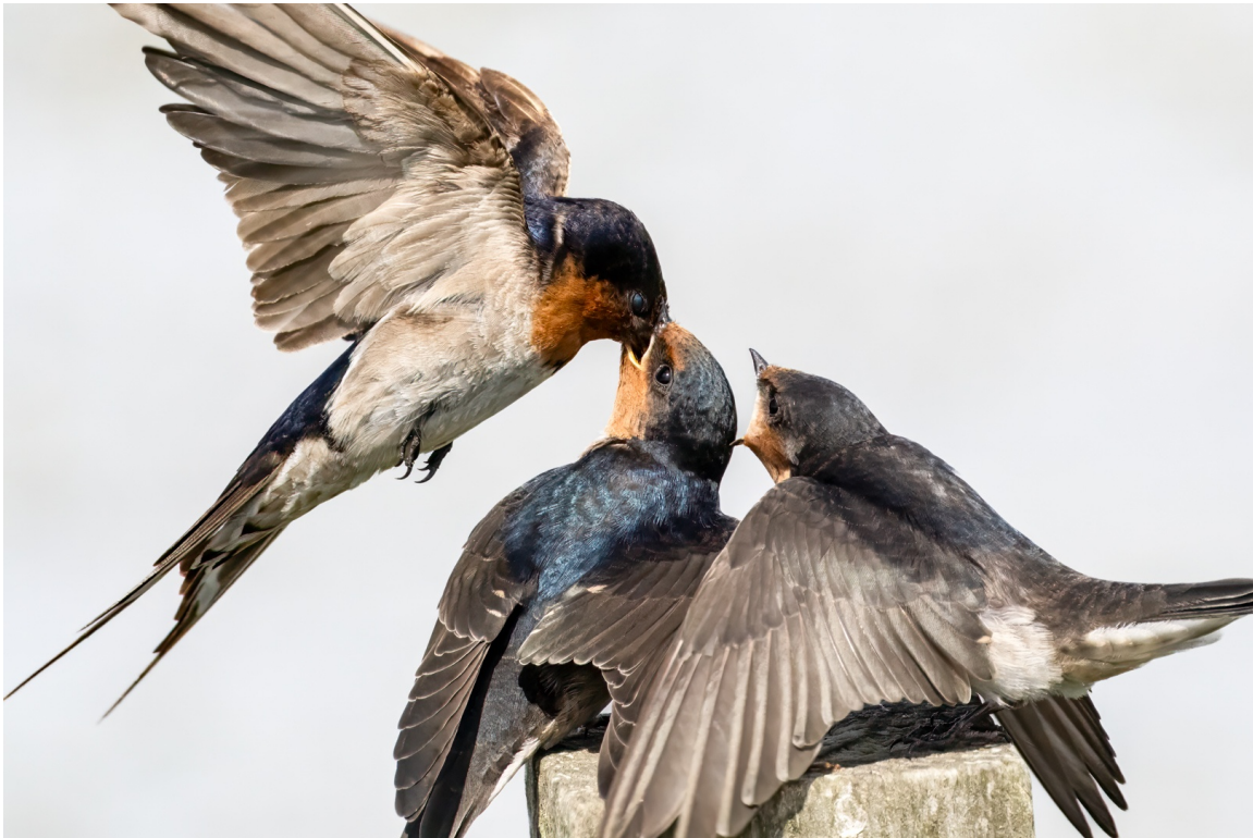
Feeding Time