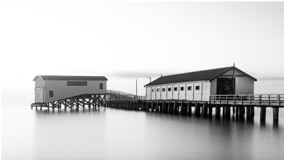
Bygone Days