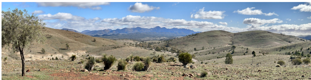
Flinders Ranges