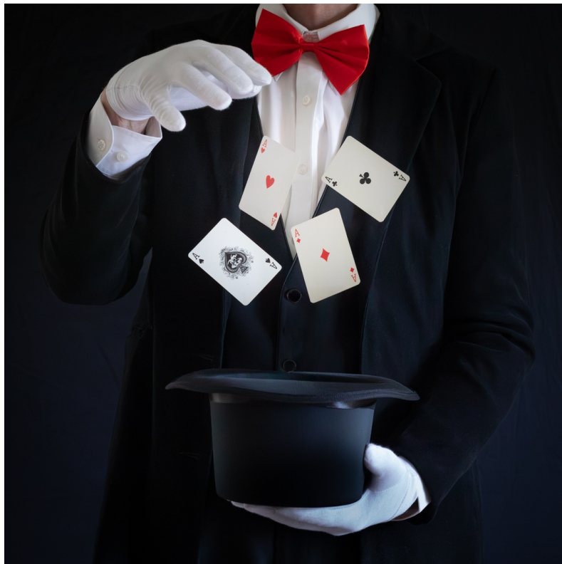
The Magician © Lynne Pearce