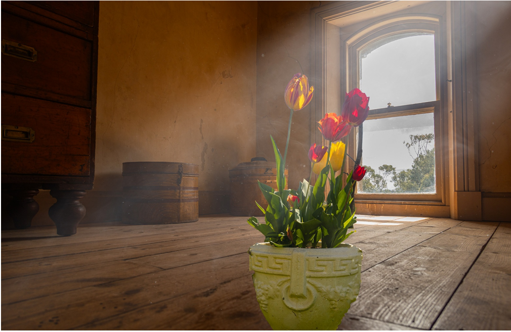
Flowers in the Attic