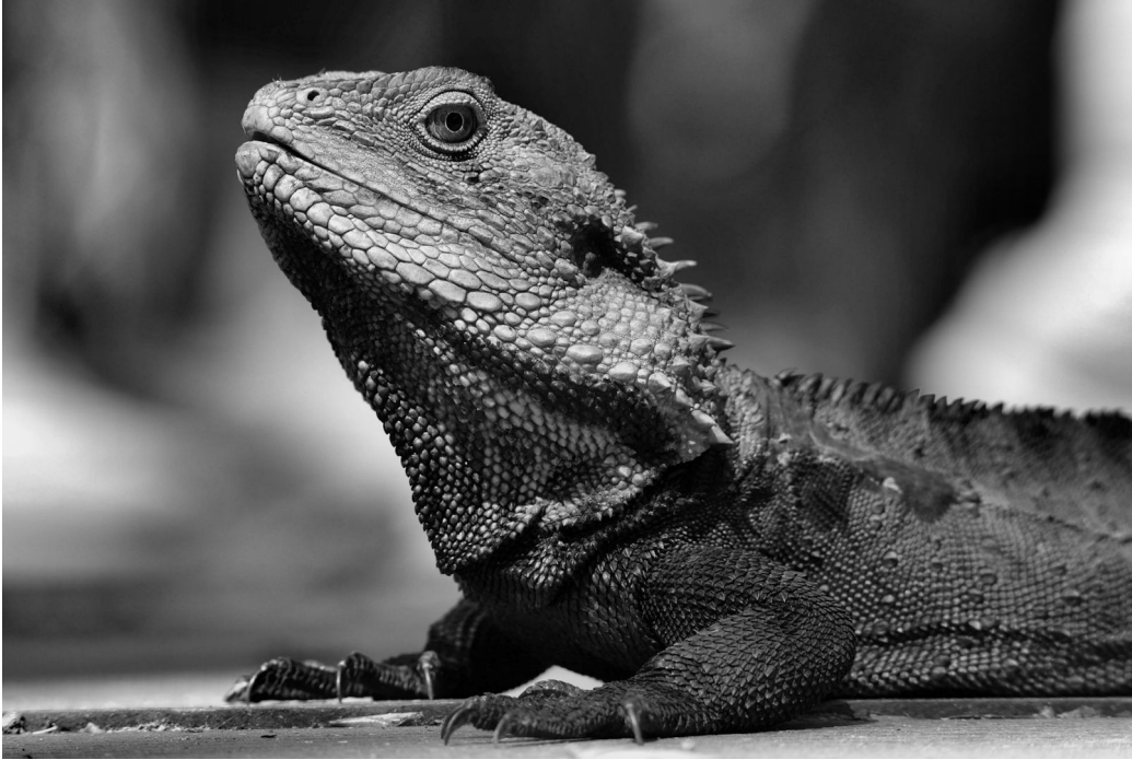
Godzilla © Geoff Evans