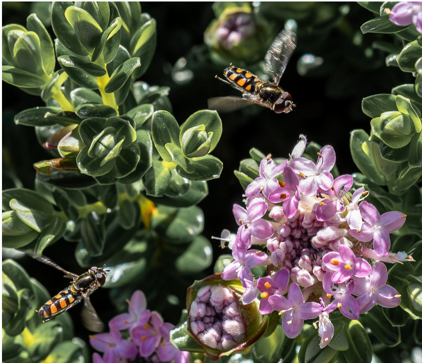
Space Invaders © Gordon Barfield