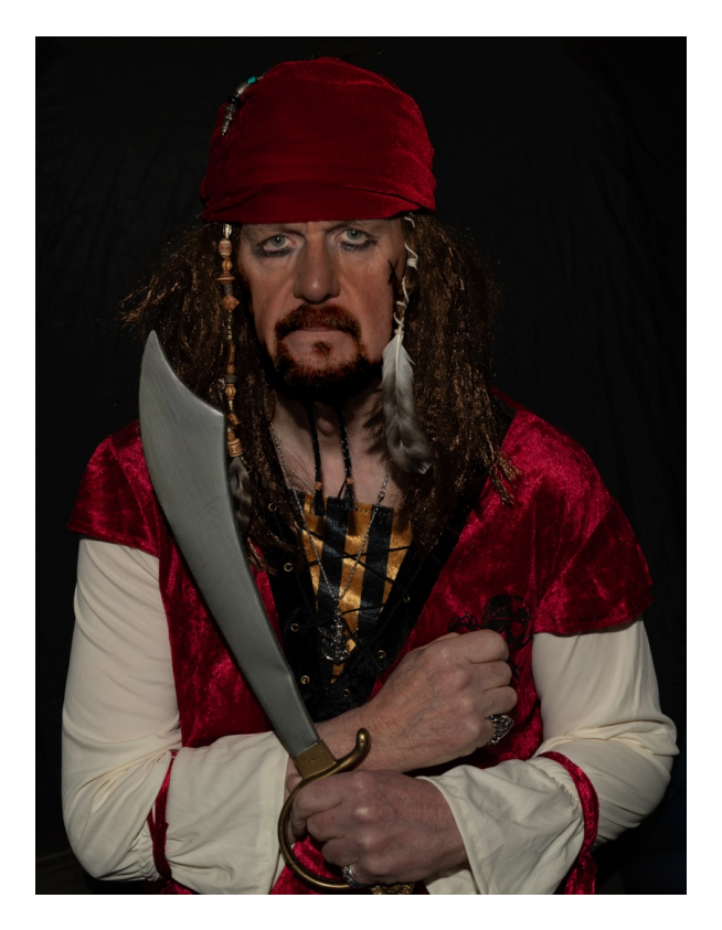
Pirates of the Caribbean © Lynne Pearce