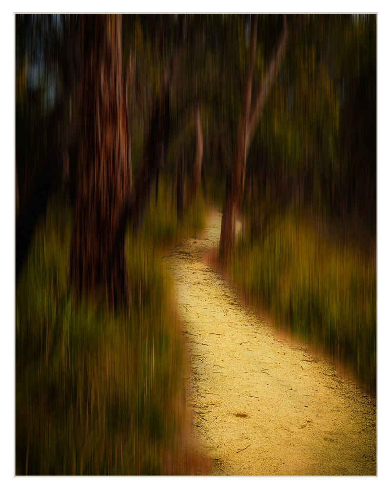
The Prime of Miss Jean Brody