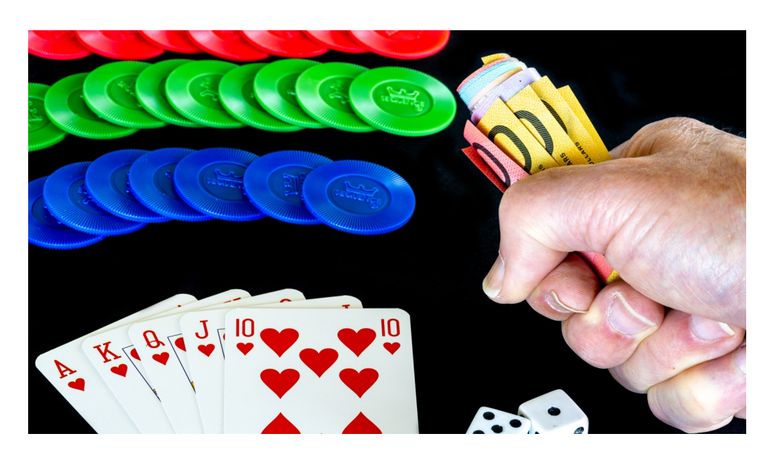
A Fistful of Dollars