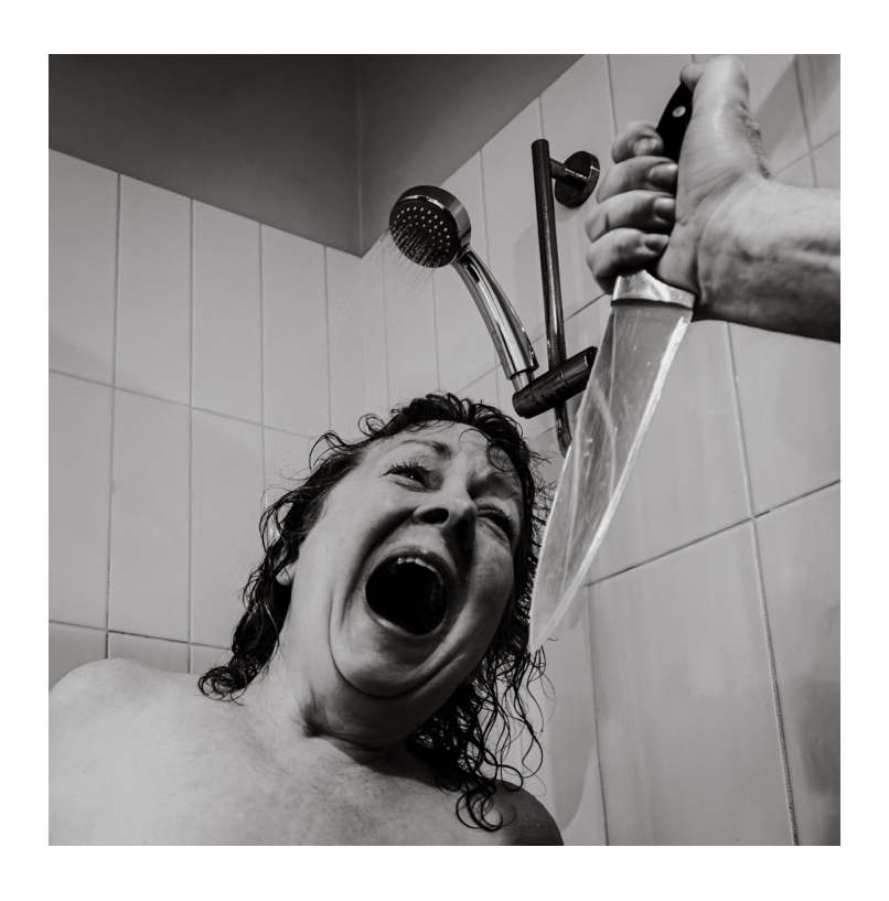
Psycho © Lynne Pearce