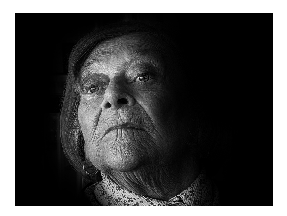
The Prime of Miss Jean Brody