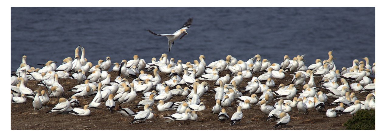
The Birds