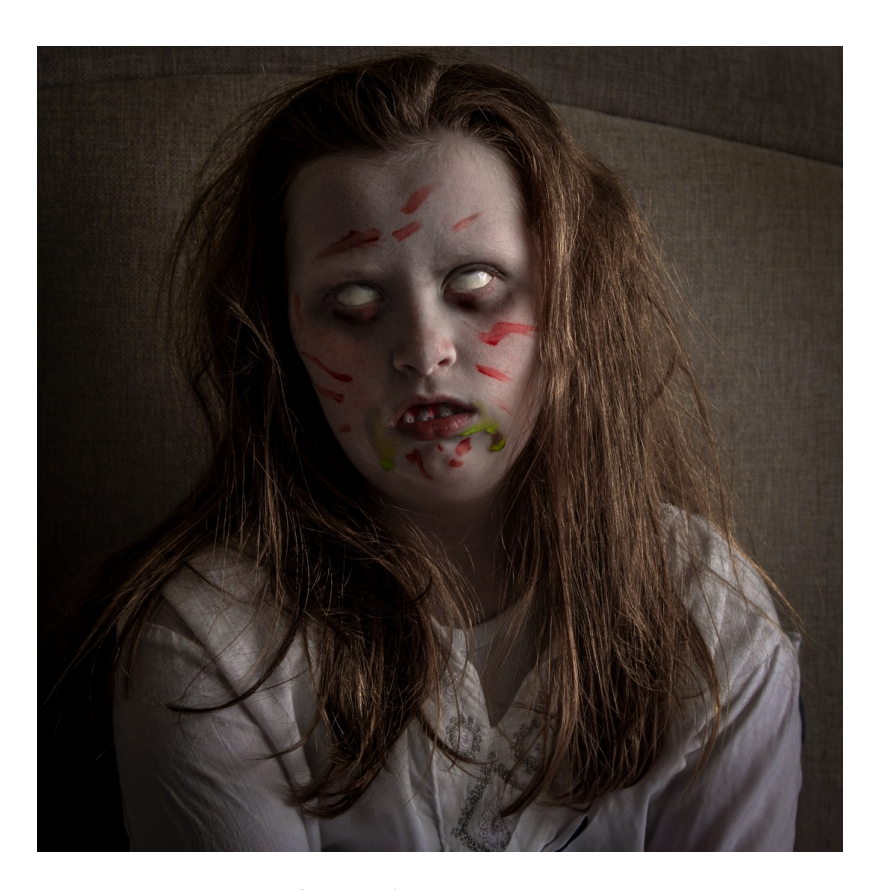
The Exorcist