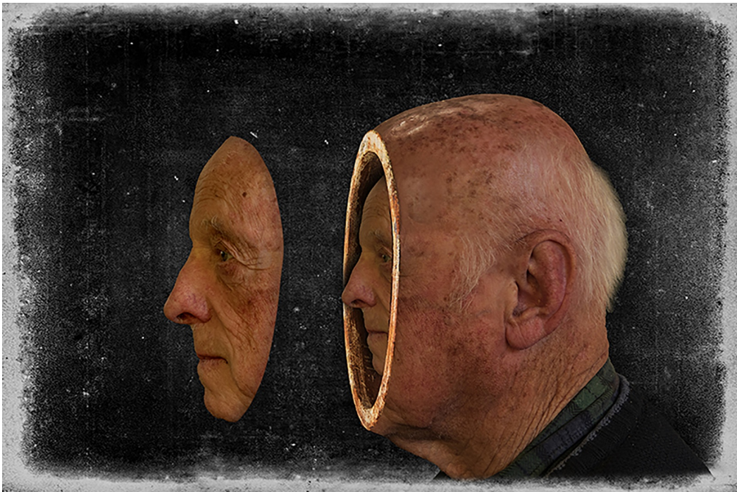
Ego © Geoff Gaskill