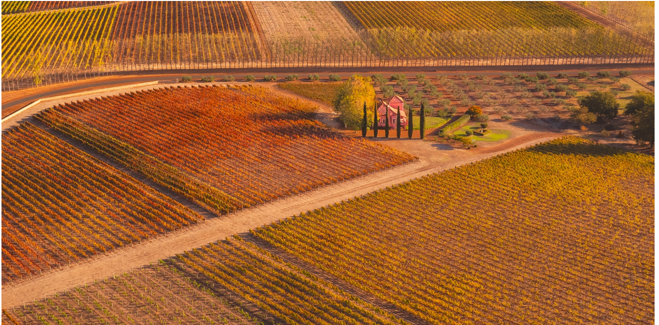
Autumn Vineyard