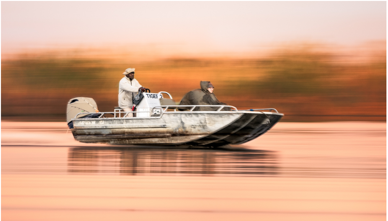
Somewhere to Be