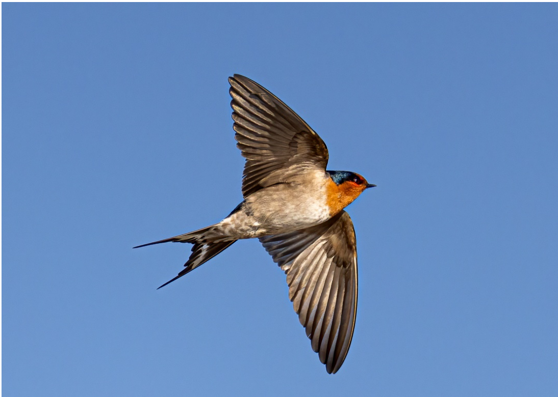
Quick As © Kevin Robley