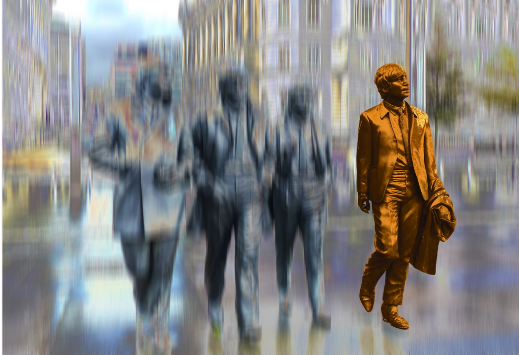
Liverpool Dreaming © Geoff Gaskill