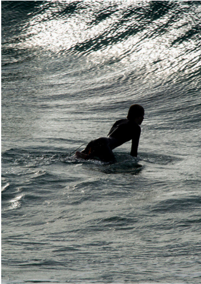
Early Morning Surf © Debbie Hallows