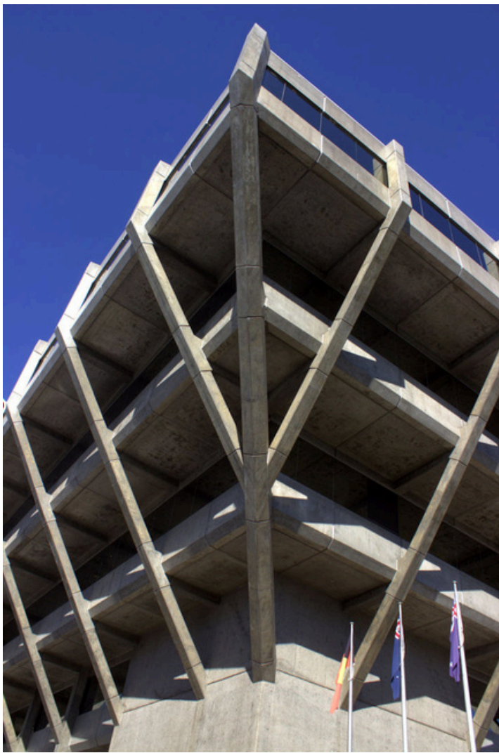
Pointing Skywards