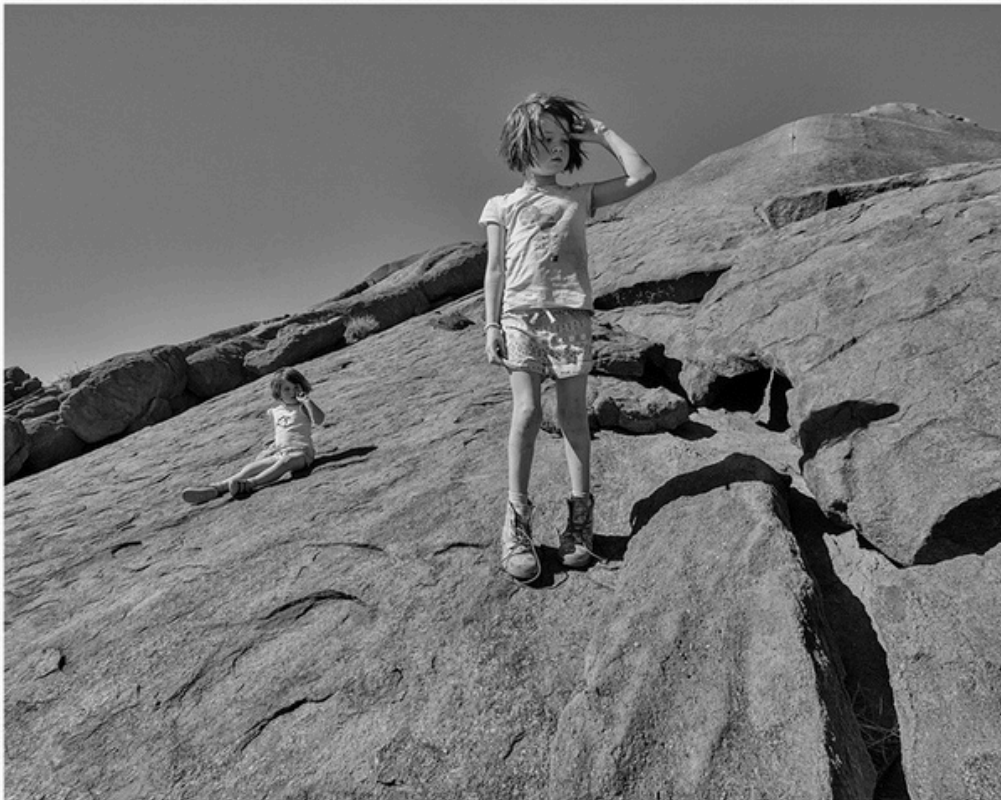
Lost