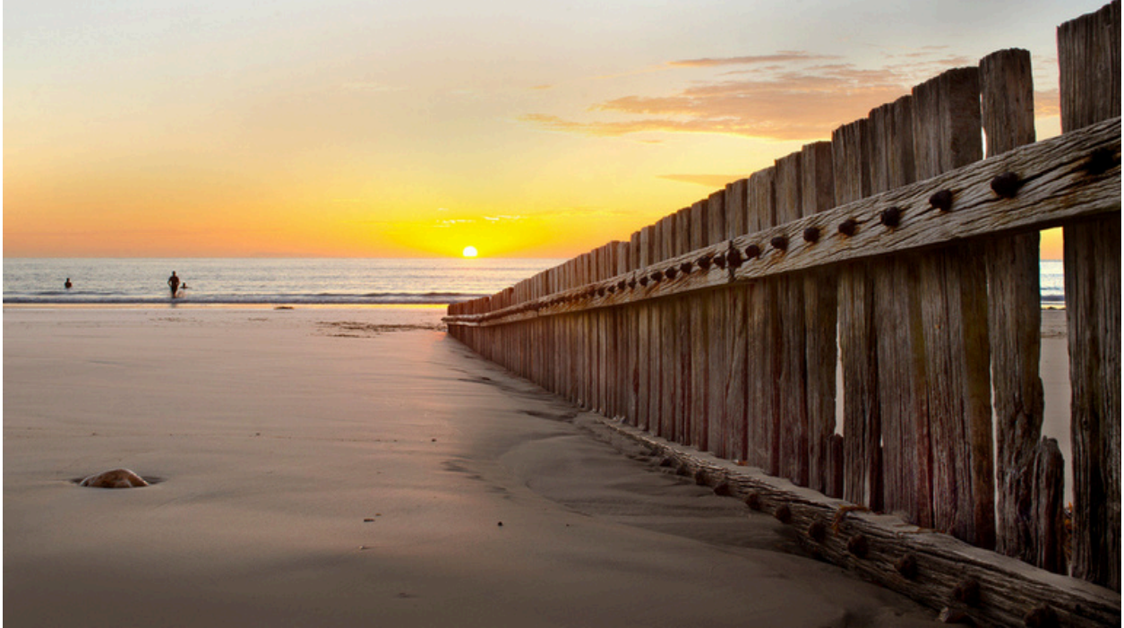
Sunrise at Torquay