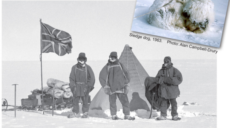
Christmas in Antarctica, 1912. Photographer unknown.