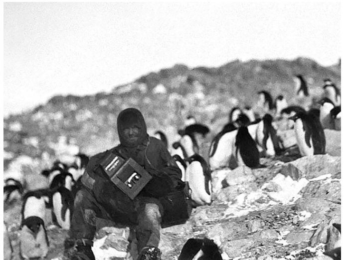
Frank Hurley sits among Adelie Penguins in Antarctica, c1912, with a Graflex stereographic camera. A small number of Hurley's stereo photos form part of The Hurley Collection, held by the National Library of Australia in Canberra.