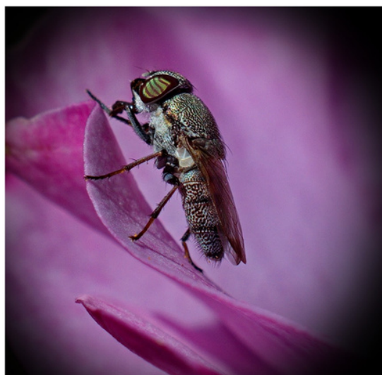
Nature's Textures