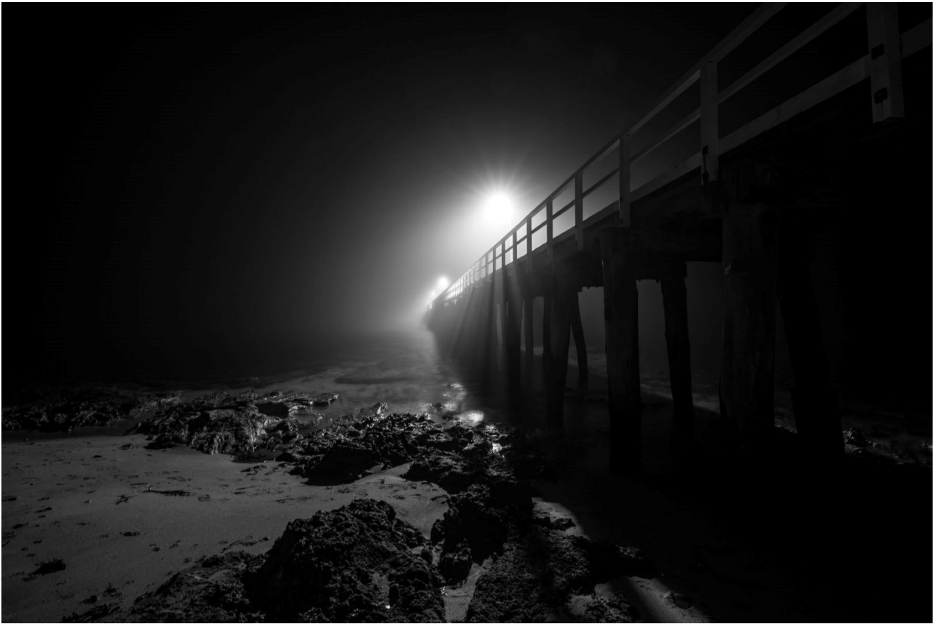
Sea Mist