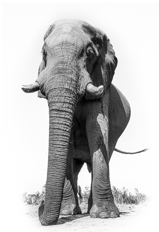
A Worm's Eye View © Neil Smith