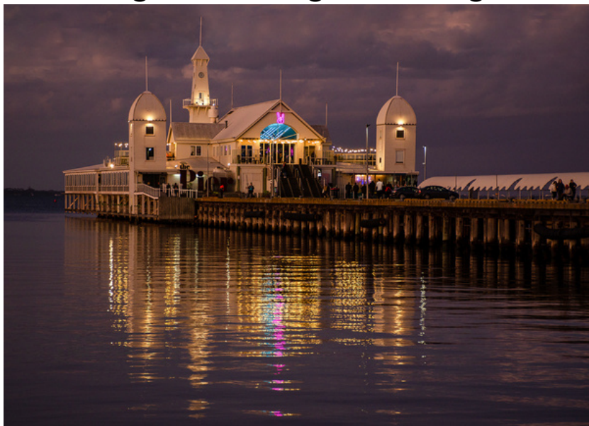
White Night

I went to the White Night Event in Geelong. It certainly attracted a crowd. It was very busy and often difficult to get a clear view of the exhibits and I was disappointed with most of my shots. I was drawn to the waterfront and decided to try for a shot of Cunningham Pier. Not having taken many night shots before, I tried different settings and used a boulder in the Poppy Kettle park to help stabilise my camera, this was my best effort, it is sharp and shows some activity on the pier with lovely cloud definition behind. A little bit of post editing to improve exposure. ( Nikon D7000 18 -140 ZoomLens)