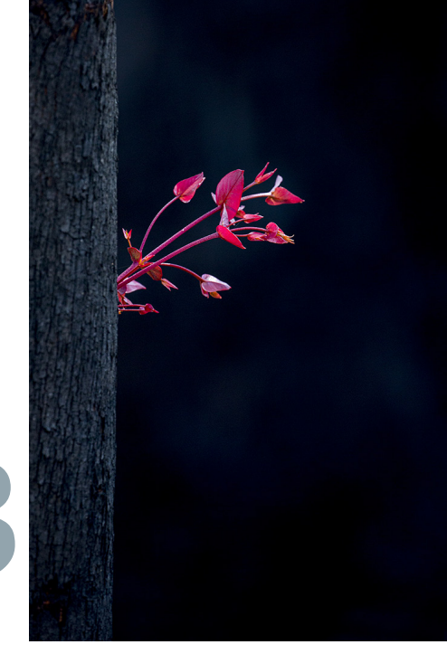
Forest Phoenix Dee Kelly