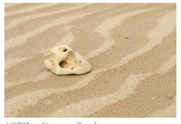
MERIT Stone on Beach Lynn Cornell