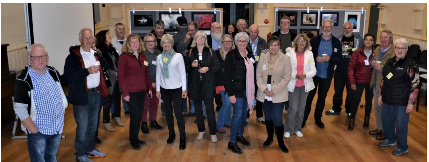
Our Christmas Breakup