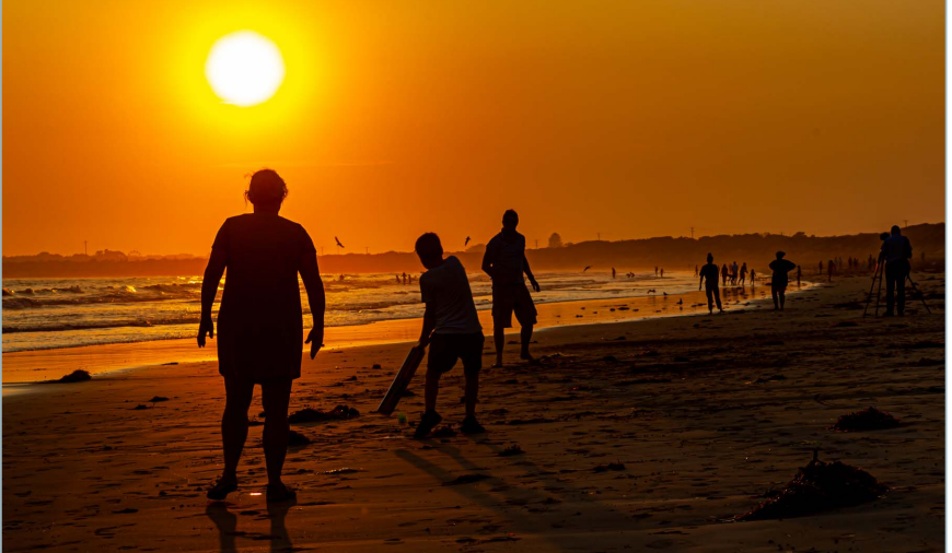
Summer Beach Cricket Lynne Pearce