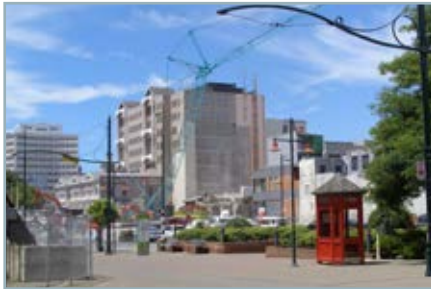
Earthquake? - What earthquake?