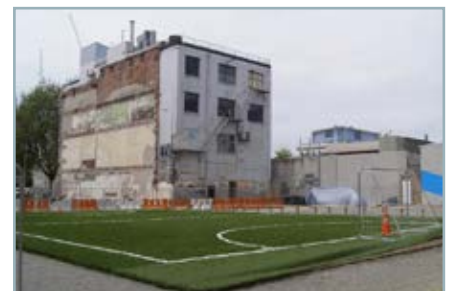
In the midst of destruction, a football pitch