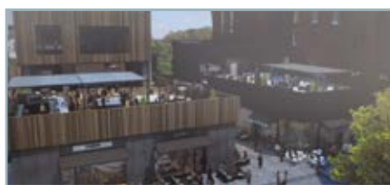
Artist impression of developments for the new Terrace Courtyard (above) and Shands Lane in Hereford Street (below)