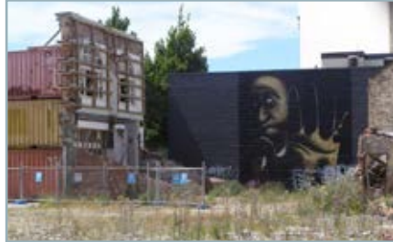
Art in a wasteland