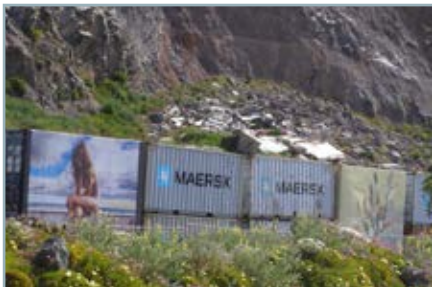
Decorated containers along Sumner Beach