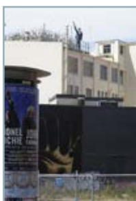
Entertainment among the ruins

Christchurch is still a great and beautiful city to visit and the locals are very welcoming. It can also be used as a base for tours all over the South Island. Cruise ships used to call at Lyttelton, some 10 km from the city, but I think they now dock at Akaroa, although Christchurch can be visited on a bus tour. It is well worth doing. ♦