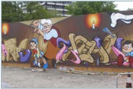
Street art - Pinocchio scene finished