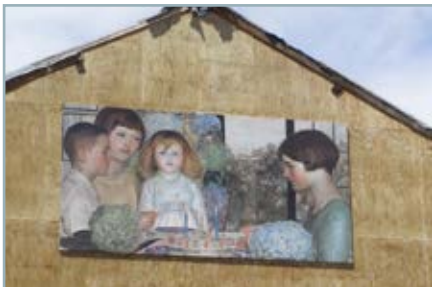
Copy of art gallery painting on building wall