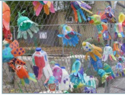
Street art, milk bottle art, Lyttelton