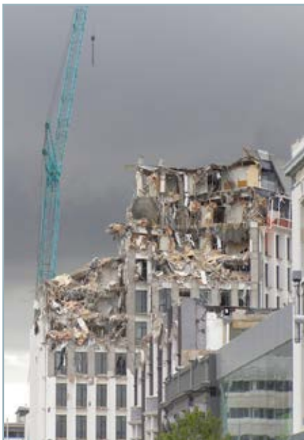
Pulling down a multi-storied building

By the fourth of September 2013, just two years after the first Christchurch earthquake, over 11,200 earthquake aftershocks were recorded in the greater Christchurch area. Most of these were not felt by residents but the number gives an idea of the psychological problem for people who continue to live in Christchurch – will there be another “big one”? Both the Christchurch Council and the New Zealand Government through the various earthquake authorities put an enormous amount of effort into trying to bring life back to normal and quickly as possible. But with something over one quarter of major buildings in the CBD demolished and several almost complete suburbs declared as uninhabitable, it will be many years before the major plans such as the Christchurch Central Recovery Plan and the Land Use Recovery Plan are fully effective. One thing is certain – the authorities see Christchurch as developing rapidly and it is expected that around 50,000 new houses will be constructed in Greater Christchurch by 2028.