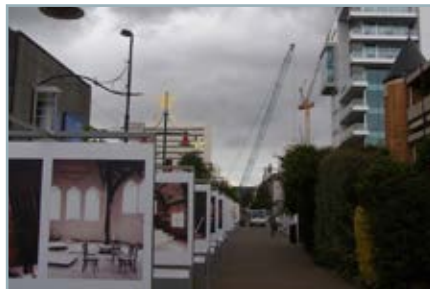
Display boards for new developments