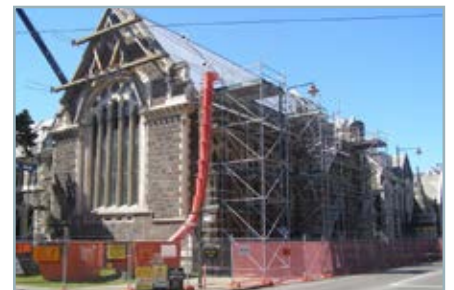
Temporary repair - metal roof and heavy stabilisation