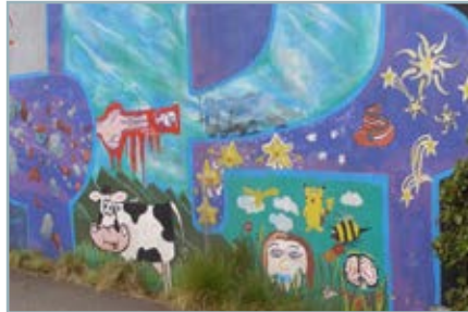
Wall in Lyttelton school