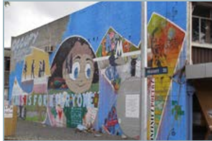
Another colourful wall in the new development area