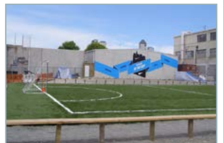
Football in the gap