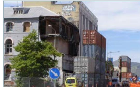
Shipping containers still support dangerous buildings