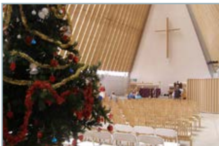
Inside the new cardboard cathedral