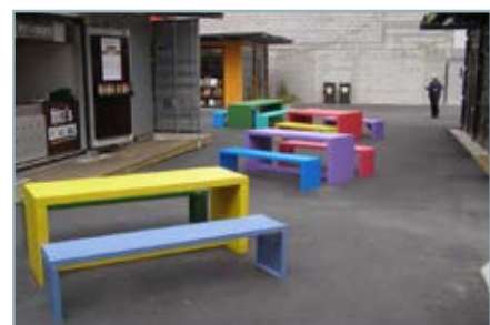
Brightly coloured outdoor furniture