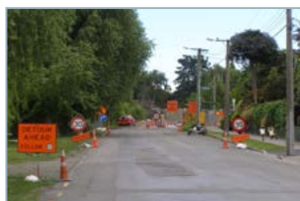
A sight so common on suburban roads