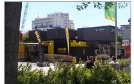
New start mall, shops built out of shipping containers