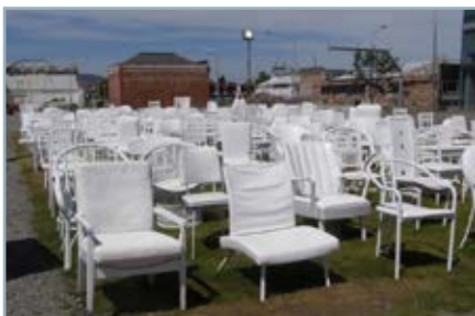
Some of the 185 white chairs to remember those who died