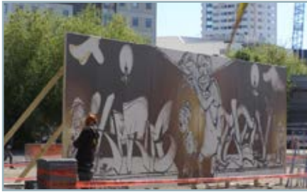
Street art - Pinocchio scene is underway

...were pleased to see that the central city looked so much more 'cleaned up'. - Tony Cavanagh