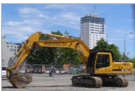
Resting on its laurels