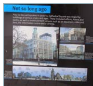
A reminder of the past