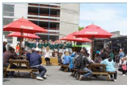
Lunchtime concert by a local school