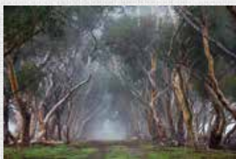
Image of the Night October - Open Competition 'Misty Tree Lane' by Jon Bagge