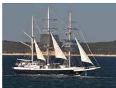
Bark Lord Nelson, UK