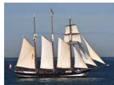
3-masted Topsail Schooner Oosterschelde, Netherlands

From Hobart the fleet set sail for Sydney Harbour to take part in the celebration of 100 years of the Royal Australian Navy, sadly arriving in rain and squalls - we certainly had the best of the weather! ☐