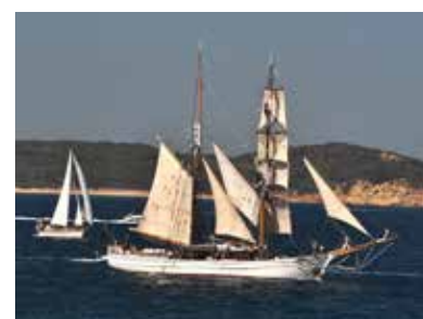
Brigantine Soren Larsen, Aust.