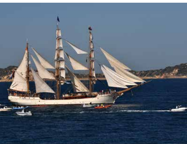
Bark Europa, Netherlands