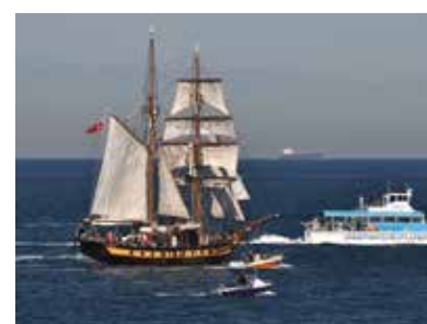
Brigantine Windeward Bound, Aust.