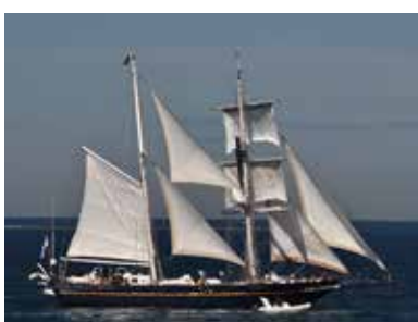
Brigantine Young Endeavour, Aust.