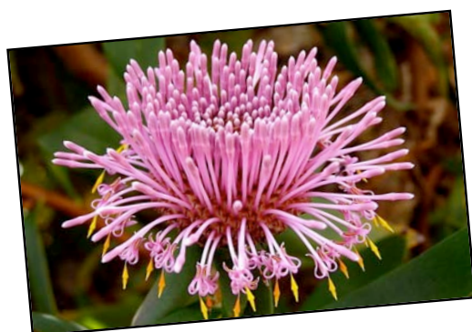
Certificate of Merit EDPI: Isopogon Cuneatus