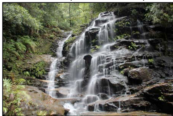
1 st Place Landscape/Waterscape at the Royal Melbourne Show – Sylvia Falls