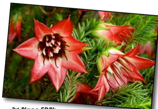
3 rd Place EDPI: Darwinia Oxylepis