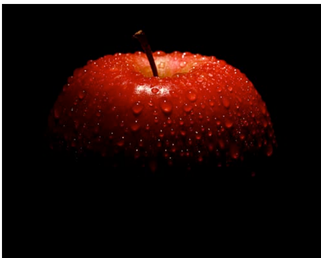
LARGE PRINTS: 3 RD PLACE - 'RED APPLE' by Darren Hobbs

Colac Camera Club was host to this year's annual three way competition between Colac, Bellarine and Corio Bay Camera Clubs. Individual awards were spread between the three clubs. In the aggregate sections, Colac won the Electronic Digital Image section while Corio Bay took out the Print section (for all results please see Page 4).