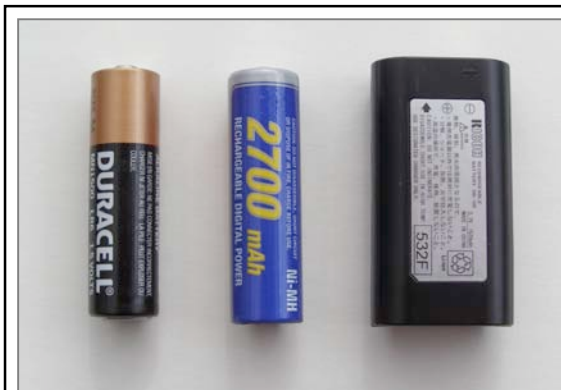
Fig.1 Three typical batteries: non-rechargeable alkaline, rechargeable NMH with capacity of 2750 mAh, and Lithium ion battery.

Most batteries used for digital cameras today are rechargeable and the better ones can be recharged up to perhaps 1000 times. They are commonly NMH (nickel metal hydride) which are much better than the older NiCd (nickel cadmium), or with some cameras, Lithium ion. These last are often in the form of a rectangular block, can be expensive to replace, and require a special charger. The other types are available as AA (see Fig 1 for examples). The AA batteries are rated at 1.2 volts, but despite the difference in voltage between non-rechargeables and rechargeables, both will operate your camera.