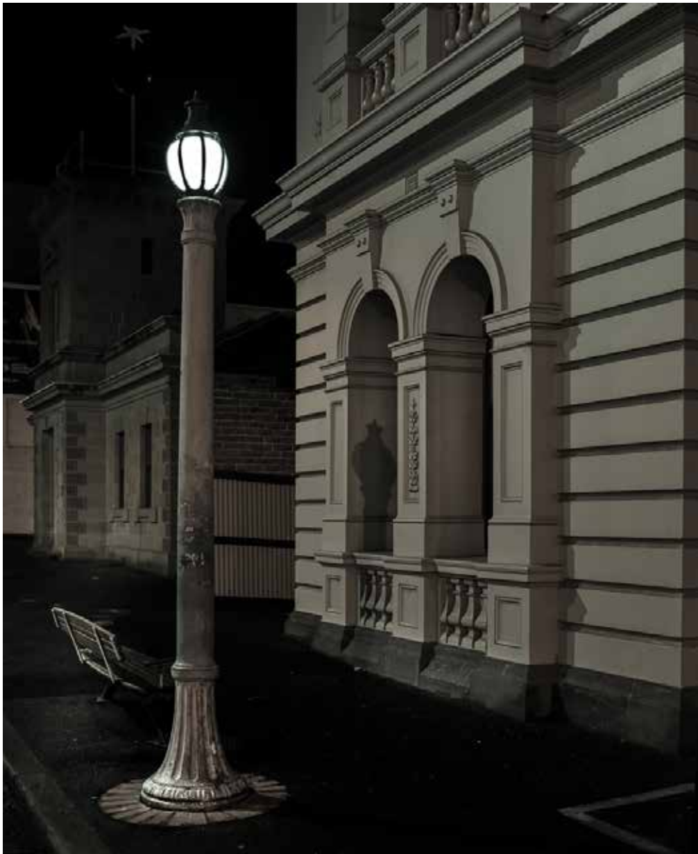
Post Office at night Nick Randall