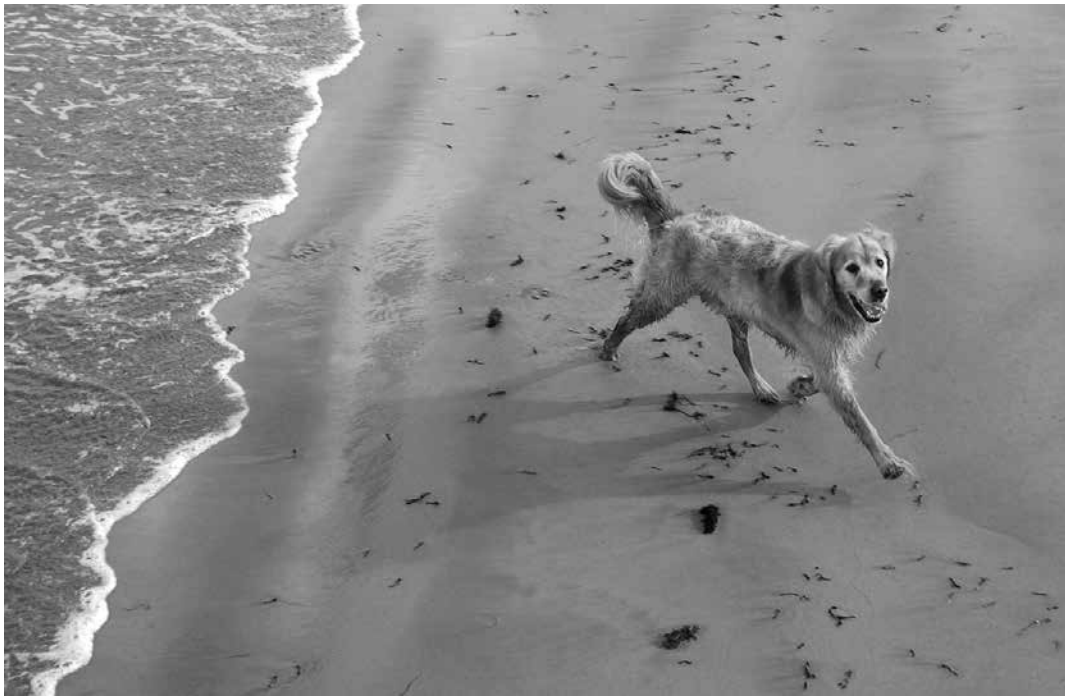
I love the beach Daryl Haywood