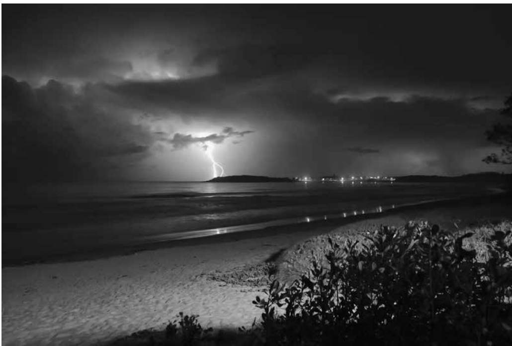
Storm Beach Daryl Haywood