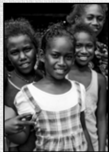
FRONT PAGE Myanmar

Bellarine Camera Club Inc. Member of VAPS