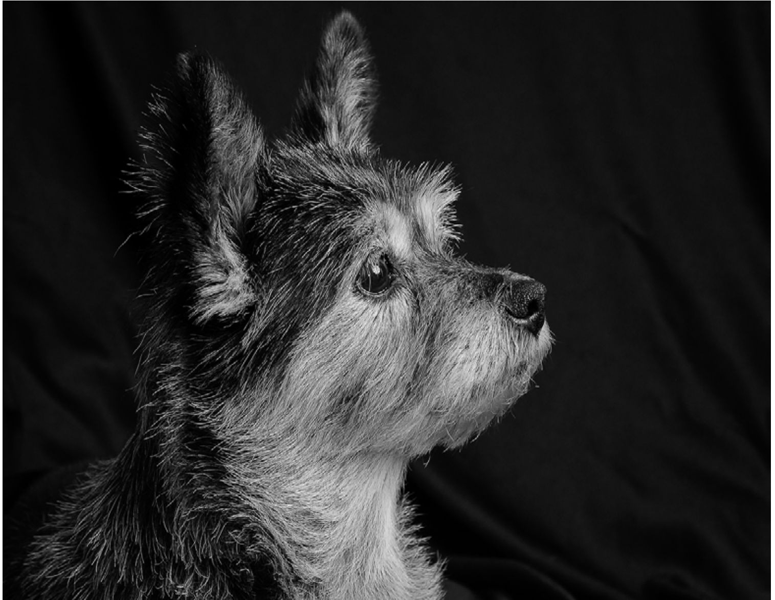
Tassie by Greg Wane