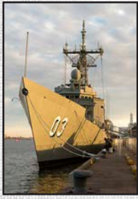
FRONT PAGE

Bellarine Camera Club Inc. Member of VAPS