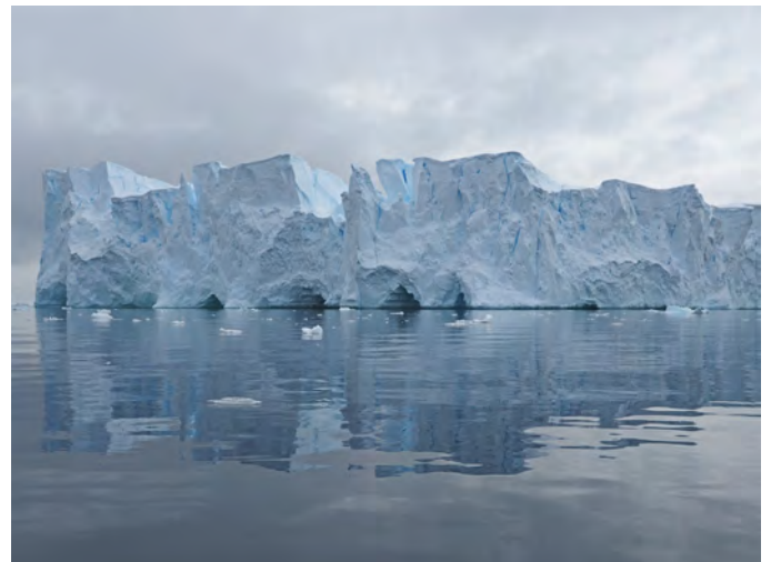
Blue Iceberg - Lynne Bryant