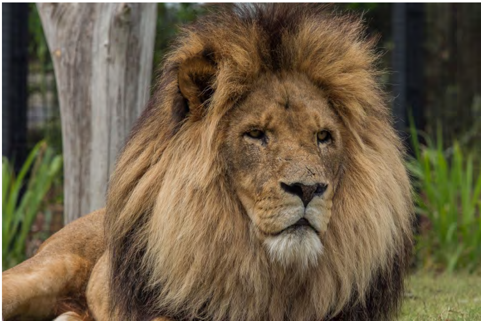
Not Happy by Ellen McIlroy