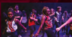
Forbidden Geelong Performing Arts Centre (Foyer) 50 Little Malop Street 7.00pm - 7.20pm Presented by Western Edge Youth Arts, North Geelong Youth Theatre