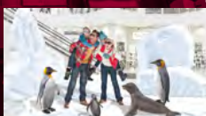
Visit Antarctica with Geelong's first augmented reality event... Visit Antarctica Market Square Shopping Centre 6.00pm - 9.00pm