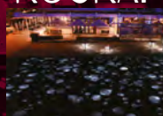
Projected Playground Customs House Lawn, 4 Eastern Beach Road 7.00pm - 8.00pm Matt Bonner and various artists