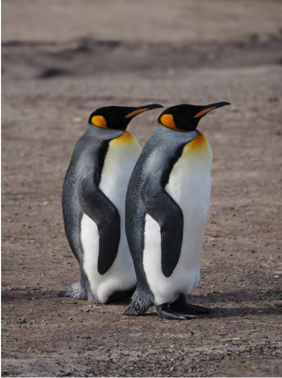
King Penguins - Lynne Bryant