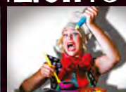
The Birthday Cake Customs House Lawn 7.30pm and 8.30pm Presented by Citizen Theatre