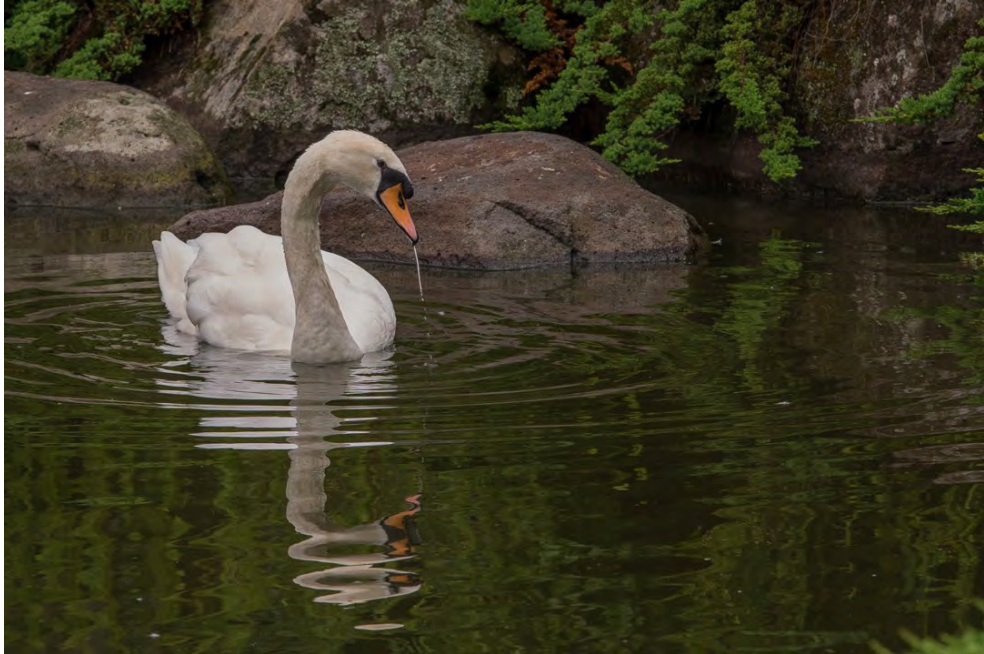
Mute Swan