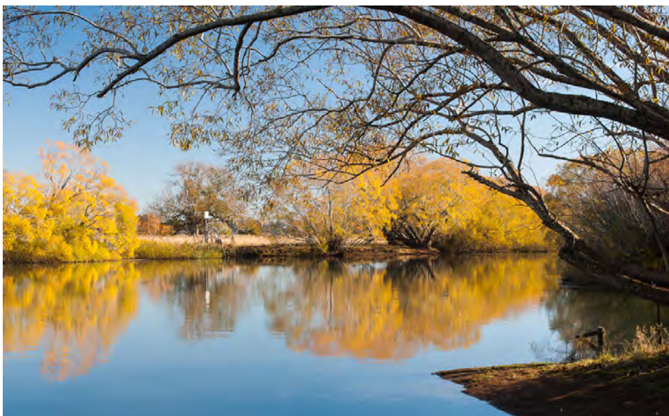
Esk River by Greg Wane