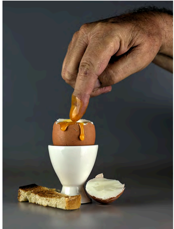
It's Soft Boiled - Bill McCall