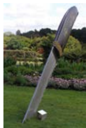
The giant knife