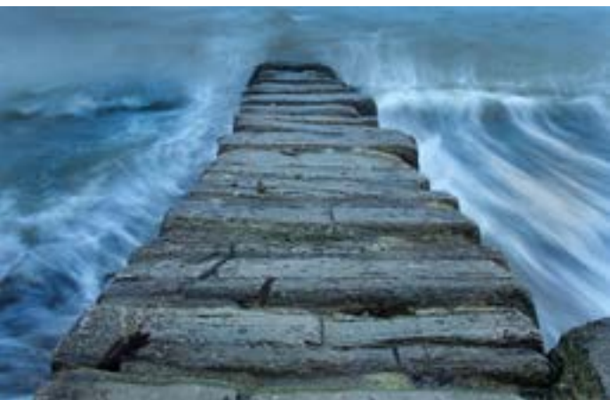
2 Tide Jon Bagge