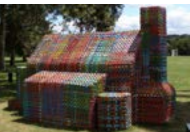
The colourful house sculpture