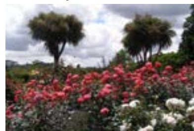
The incongruity, roses and cabbage trees