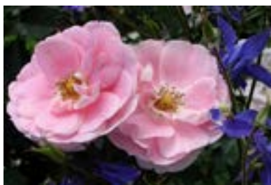
Botanical roses and granny bonnets