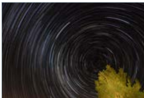
Merits: Star Trail Tree - Roger Northam