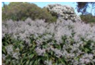
One of New Zealand's classic plants, Renga Renga