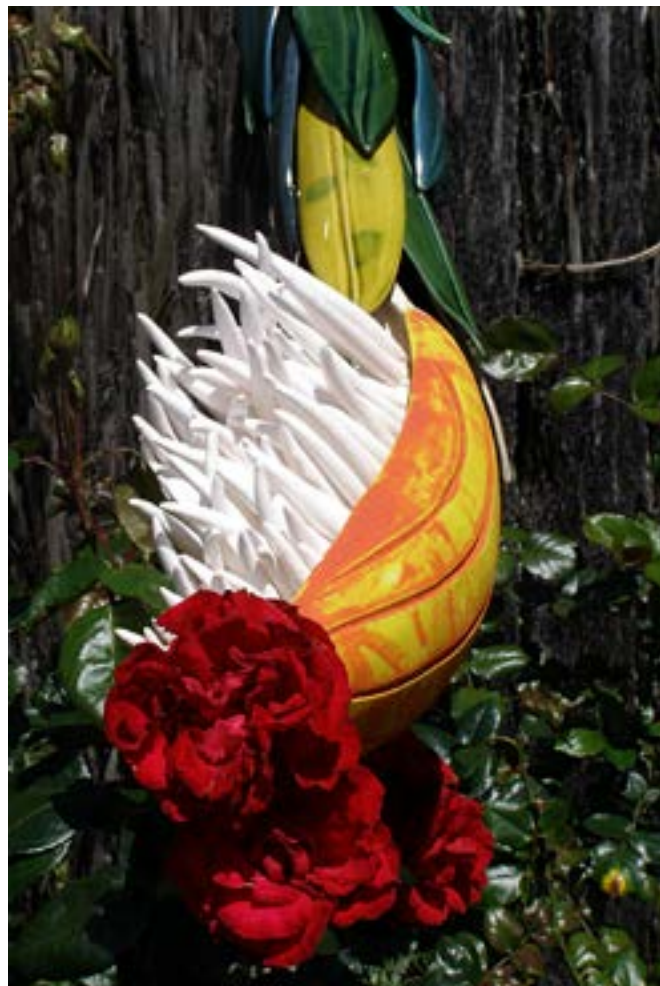
Alien among the roses

The surprising thing for me was that the picture which won was not the one I considered my best. It was called "An alien among the roses" and was actually part of one of the garden sculptures so that may have been in its favour. I have included copies of my two entries and several others from the Gardens. If you are ever in Auckland (which is a surprisingly large city with a population of nearly 1.5 million), it is worth making a trip to the Gardens which are about 30 minutes south.